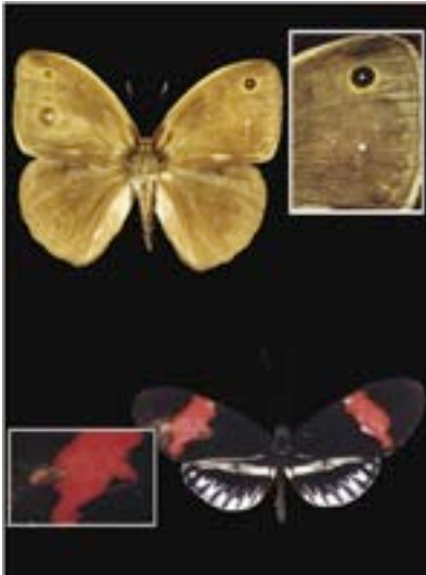
Marta de Menezes "Nature?", 1999