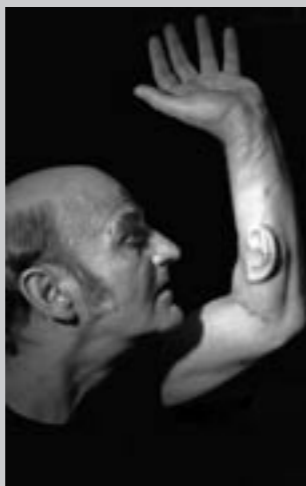
Stelarc, Extra Ear: Ear on Arm . 2006.