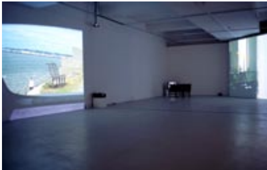
Grace Weir : Déjà vu, 2003 (installation detail)