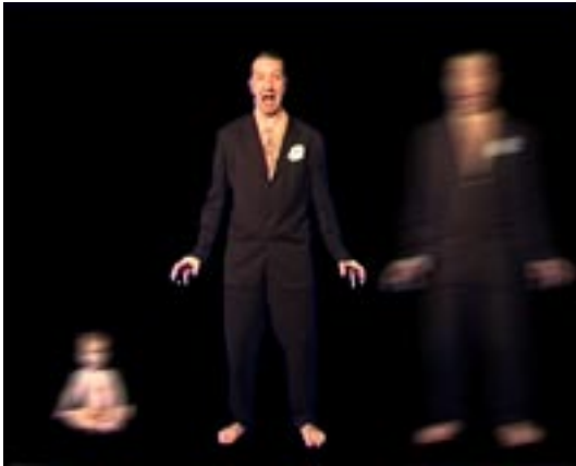
Lei Cox: Teleportation Experiment (detail), 2004